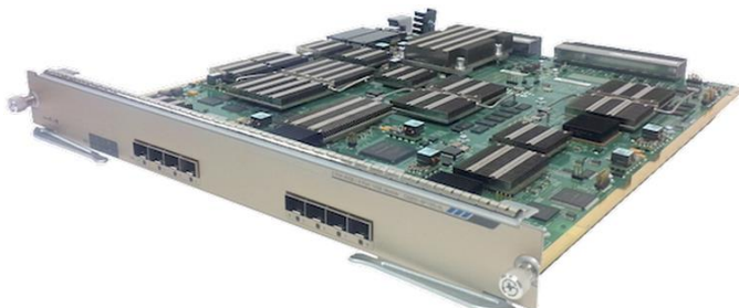
Figure 3. 6800 Series 8-Port 10-Gigabit Ethernet Fiber Module

The C6800 Family 8-port 10-Gigabit Ethernet Fiber module provides up to 40 10-Gigabit Ethernet fiber ports in a single Cisco Catalyst 6807-XL Switch chassis, or up to 80 10-Gigabit Ethernet fiber ports in a Cisco Catalyst 6807-XL Virtual Switching System (VSS) 2T. It also provides up to 88 10-Gigabit Ethernet fiber ports in a single Cisco Catalyst 6513-E Switch chassis or up to 176 10-Gigabit Ethernet fiber ports in a Cisco Catalyst 6500 Virtual Switching System (VSS) 2T.