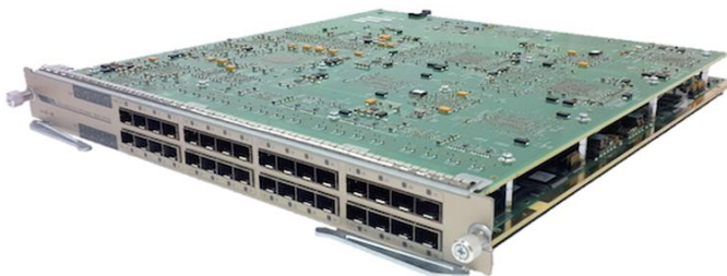
Figure 1. 6800 Series 32-Port 10-Gigabit Ethernet Fiber Module.

The C6800 Family 32-port 10-Gigabit Ethernet Fiber module provides up to 160 10-Gigabit Ethernet fiber ports in a single Cisco Catalyst 6807-XL Switch chassis or up to 320 10-Gigabit Ethernet fiber ports in a Cisco Catalyst 6807-XL Virtual Switching System (VSS) 2T. It also provides up to 352 10-Gigabit Ethernet fiber ports in a single Cisco Catalyst 6513-E Switch chassis, or up to 704 10-Gigabit Ethernet fiber ports in a Cisco Catalyst 6500 VSS 2T.